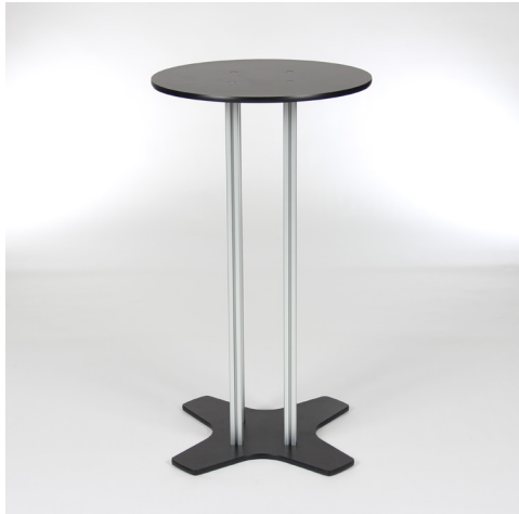
Next, attach table top to poles with bolts & Allen wrench.