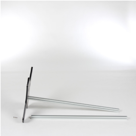
Attach poles to base with bolts & Allen wrench from below.