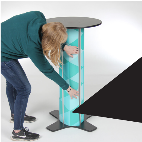
Insert graphics into outer channels of poles.