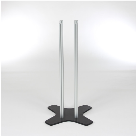
Once all four poles are attached to base, place table upright.